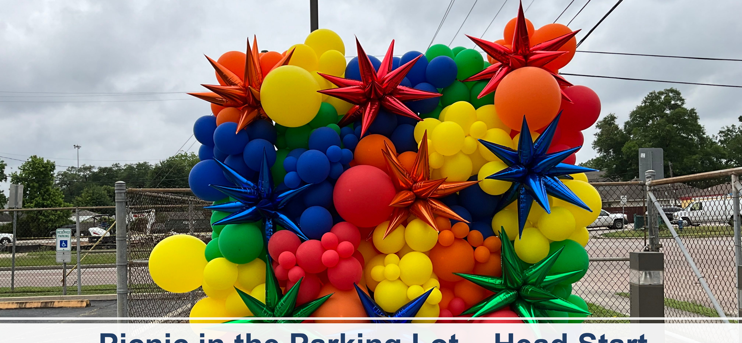
Picnic in the Parking Lot – Head Start